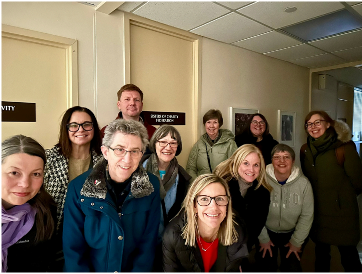
Outside our NGO Representative Office before the Civil Society Forum.

This was the first of many future conversations. The Communicators and NGO Liaisons will continue to gather virtually, and we will reunite at the Assembly of the Whole in 2026. Until then, we are excited to contribute to and support the larger visioning of the Federation and to fulfill its mission together.