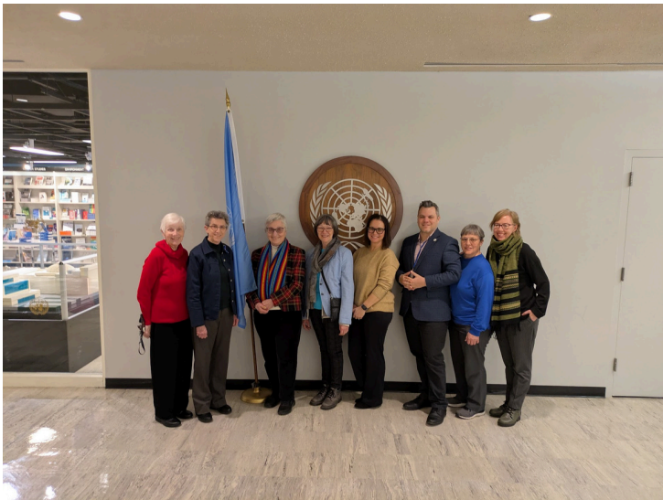
NGO Liaisons and NGO Representative gather at the UN. Other NGO Liaisons virtually attended meetings who could not attend in person.