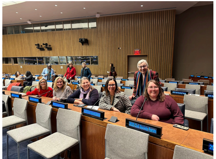
NGO Communicators and Liaisons in Conference Room 4 in UN Headquarters before start of Civil Society Forum.