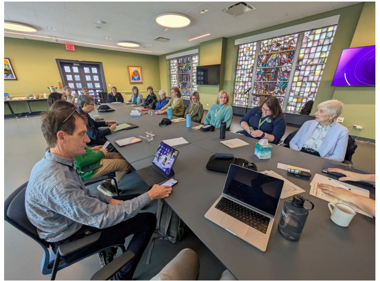
NGO Liaisons & Communicators meet to build community and strategically discuss future collaboration.